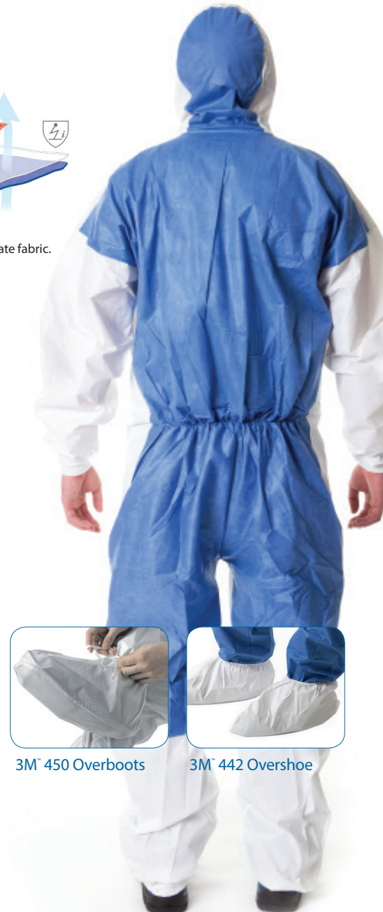
3M ® 450 Overboots

EN 1149-1: 2006 EN 1149-5: 2008 Anti-static