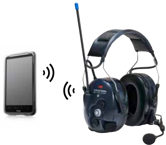
▲ The WS Lite-Com with Bluetooth lets you take wireless phone calls and listen to music in the headset.

Stereo microphones on the headset allow you to hear surrounding noises and talk to people around you without removing the headset and putting your hearing at risk. The surround sound feature attenuates impulse noises to a maximum of 82 dB and enhances weak sounds so that you can hear them even better than you would without the headset.