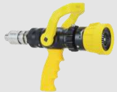
Attack 100-Pro Series Nozzle