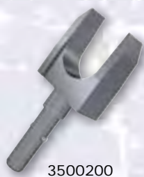
3500200 Assisted Rescue Tool Only